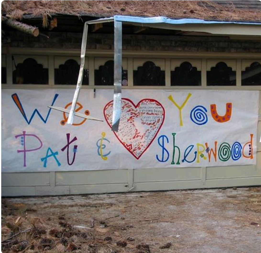
Lakewood Heights neighbors welcome you home from Katrina evacuation.