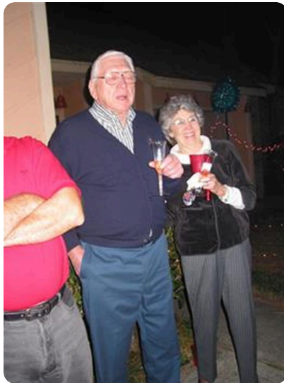
With neighbors welcoming in the New Year.