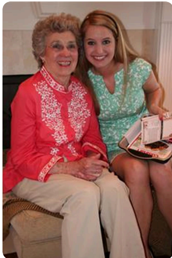
Enjoying fun at a wedding shower.