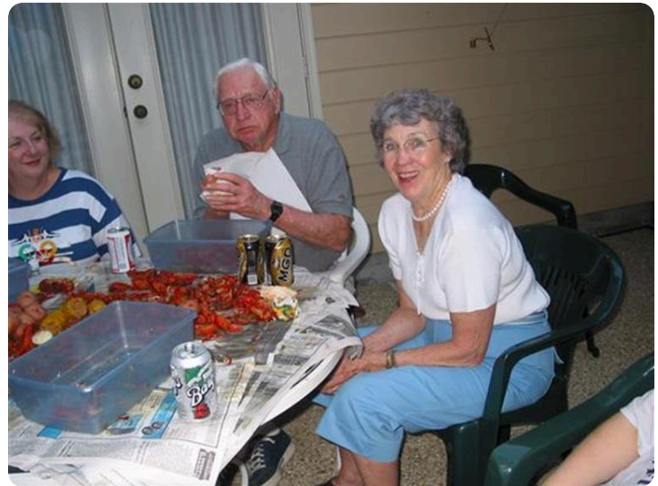
Enjoying a backyard crawfish boil.